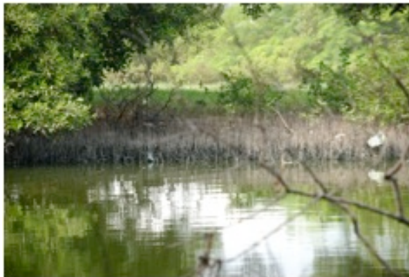
Students observed Mangroves inside the Theosophical Society.

This is the second year OMHS is participating in Tamil Nadu Science Forum and this year, we have taken the competition to another level. With ten projects going on, students are learning about a range of subjects from termites to energy conservation. This year's Forum is entitled 'Save our Earth' and has inspired students to develop their scientific skills in order to assess problems that affect our Earth and to find probable solutions.