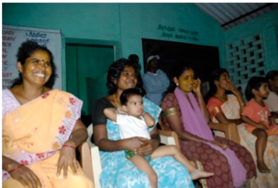
Mothers of Urur Olcott Kuppam's primary school children.

The community dinners are a way to build relationships with the parents. The idea is to go to the community without any specific school agenda and simply get to know them. Thus far, community dinners have been held in Chemincherri and Urur Olcott Kuppam.